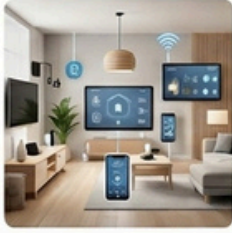
Smart Home Automation