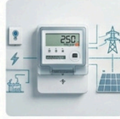
Smart Metering & Energy Platforms